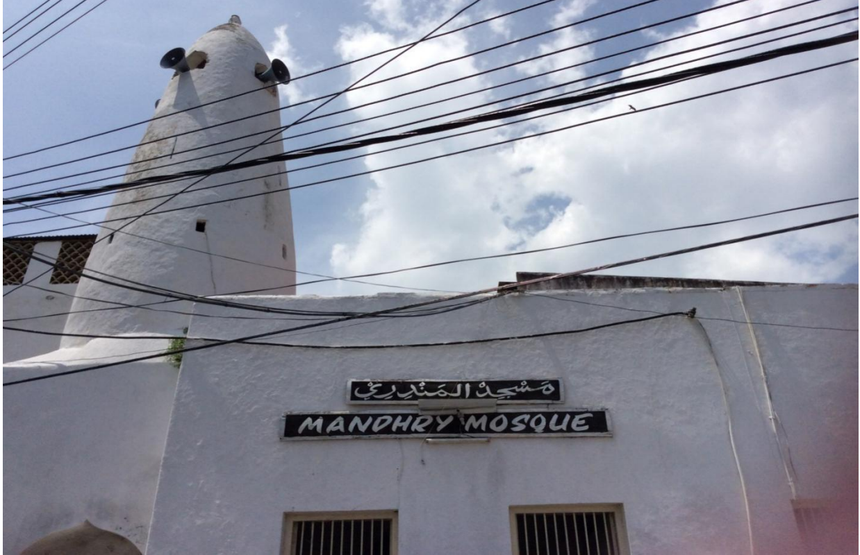
Masjid Mandhry, Mombasa. Note the 16 th century architecture and minaret.