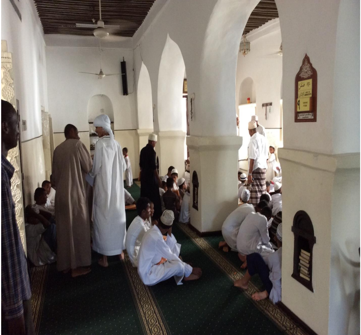
Inside masjid Mandhry, Mombasa. Note the infusion of modern and ancient architecture in the banaa ( mana) ceiling.