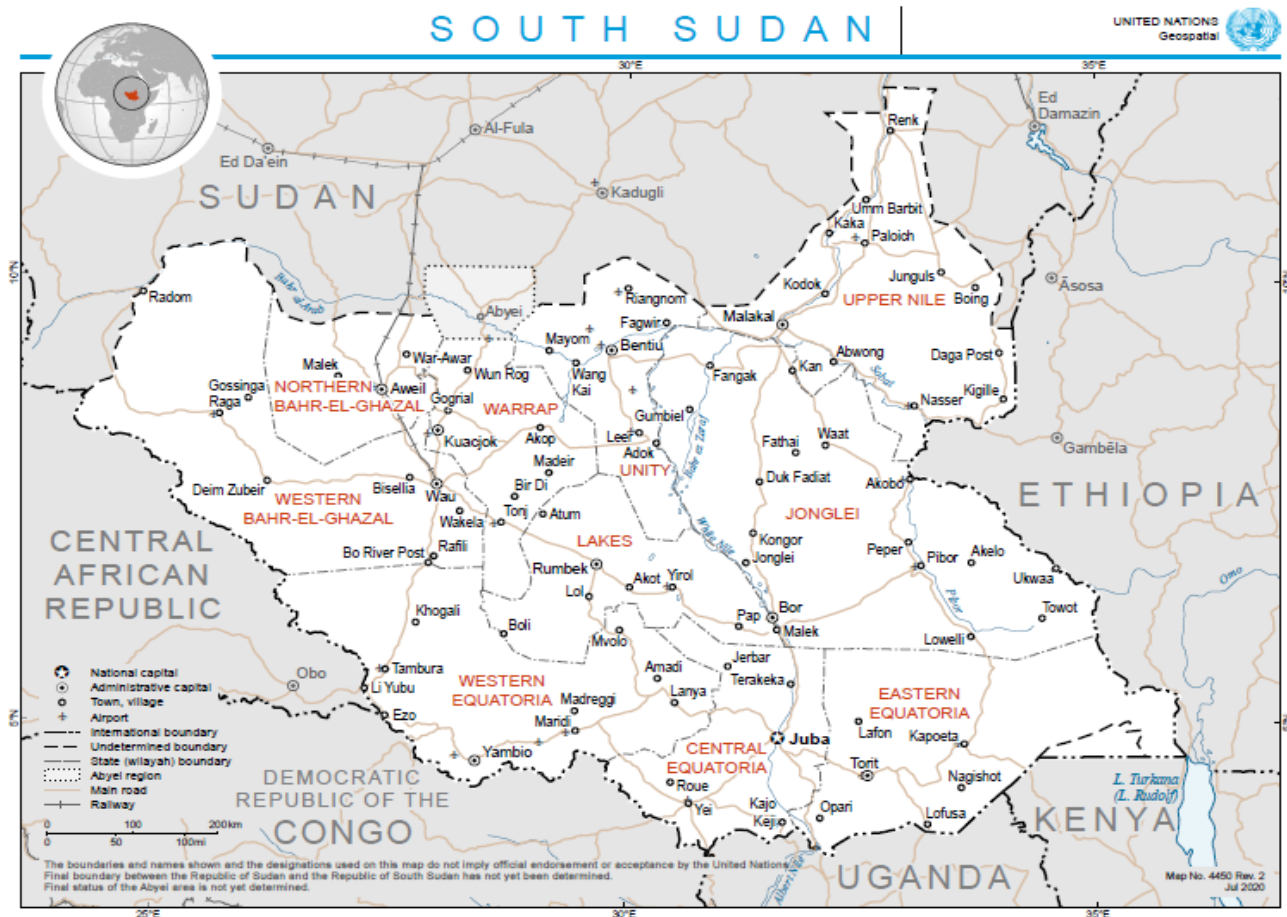
Figure 2. Map of south Sudan.

where n = Minimum Sample Size; N = population size; -e = precision set at 95% (5% = 0.05)